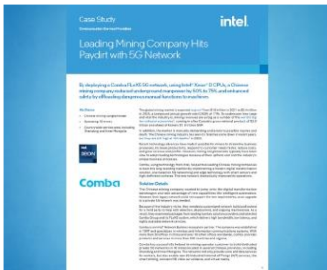
Joint Case Study with Intel: Leading Mining Company Hits Paydirt with 5G Network