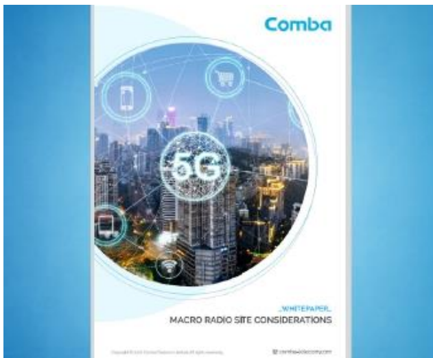
Whitepaper: Macro Radio Site Considerations