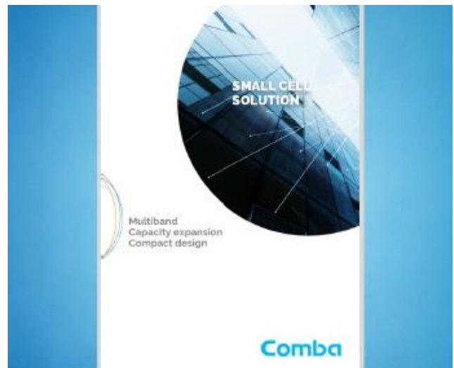
Brochure: Small Cell Solution